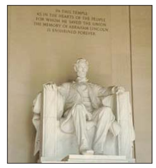
The Lincoln Memorial.

One of my other favorite experiences was our National Rural Electric Cooperative Association (NRECA) Youth Day meeting. Most every state