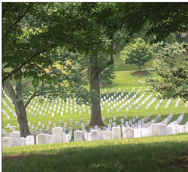
Arlington National Cemetery.