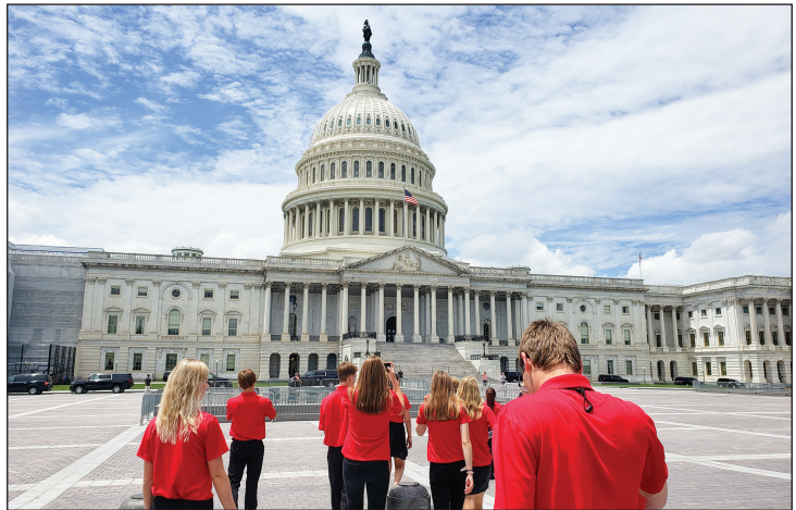
Day at the Capitol.