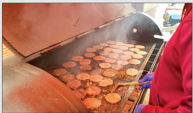
Example of the game day offering.