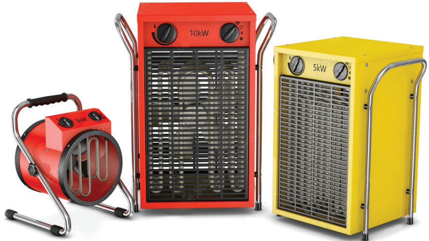
Space heaters are the second leading cause of home fires and home fire injuries. When using them, be vigilant. | FILE PHOTO